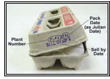
Marking Requirements, Refer to CCR 1354.—1356.

Name | Address | Zip Code | Quantity | "Keep Refrigerated" | Julian Pack Date | Sell by Date | USDA or CDFA Registration Number | *Size and Grade | *Shell Egg Food Safety Compliant (or CA SEFS Compliant) | *Must be printed in font 1/4 inch or larger