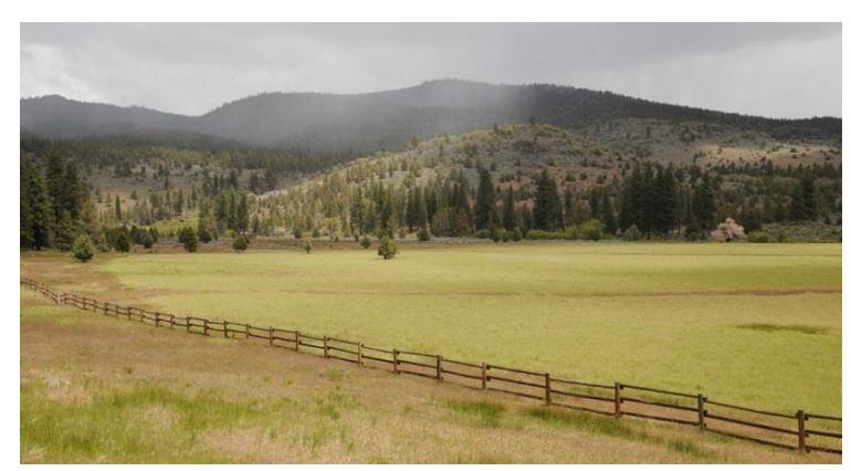
Susanville Ranch Park www.susanvilleranchpark.com